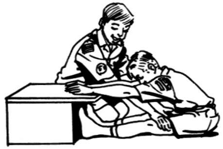
"Sit and reach" to measure lower-back flexibility.